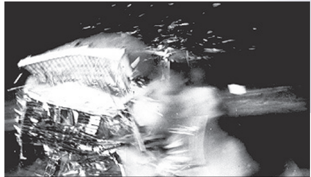
Annie, a 16-kiloton atmospheric test fired from a tower on March 17, 1953, destroyed this house in less than three seconds.