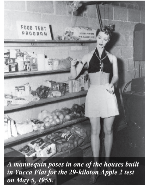
A mannequin poses in one of the houses built in Yucca Flat for the 29-kiloton Apple 2 test on May 5, 1955.

The two-story homes, which still stand today, were subjected to a pressure of